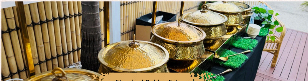
Standard Golden Setup